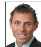
Patrick Brown PARLIAMENT HILL

Our college is continuing to grow and create jobs and opportunities for Barrie with the opening of the new Georgian Centre for Health and Wellness.